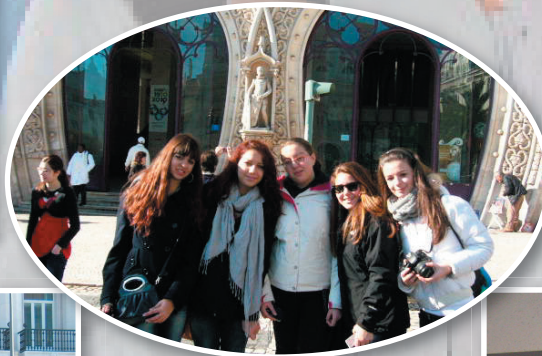
Our students in Lisbon