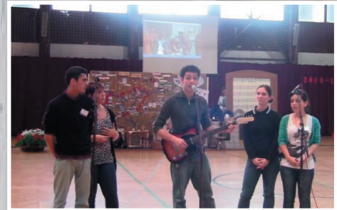
Playing the guitar and singing in Nyiregyháza