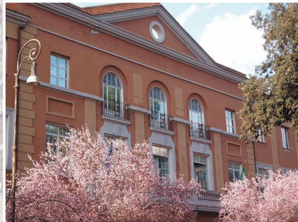
The G. Caetani School

EPICURUS He preached that the purpose of human life should be seeking pleasure. He was misunderstood, though. By "pleasure" Epicurus meant peace of mind and freedom from all passions. If you have chosen Epicurus, make sure your message is clear.