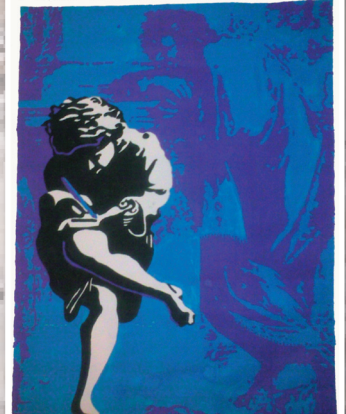
"Use Your Illusion" Guns N' Roses Cover