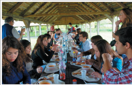
Having Goulash together