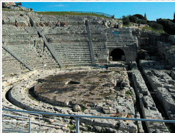
The Theatre of Siracuse

HYPATIA THE BRAVE She was the only woman philosopher among men and she taught that logic was the only human instrument to reach truth. Whether a victim of fanaticism or not, she paid with her life for her beliefs. If you have chosen Hypatia, your courage is physical and moral, too.